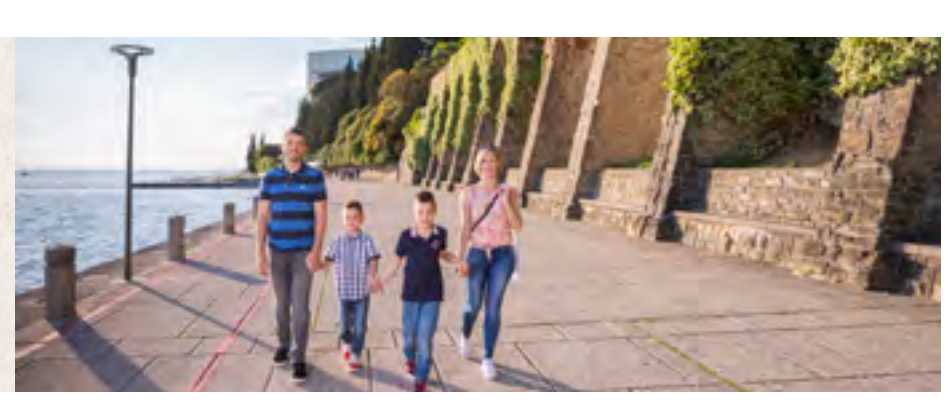
On Foot From Portorož to Piran The footpath from Portorož to Piran offers a pleasant walk for all lovers of the sea. The path is away from the hustle and bustle of traffic, with only the sound of the waves keeping you company, as this walking path runs right along the shore.

harvested early in the morning? The truffle hunter and her dog will open the door to the mysterious world of truffles. Together, you will go into the forest to a hidden corner where, with a bit of luck, you will find this fragrant mushroom among the roots of the mighty trees. After the hunt, we will treat ourselves to some typical Istrian fuži pasta with truffles, accompanied by a glass of wine from a local winemaker. (Istraterra organisation)