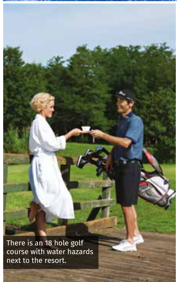
There is an 18 hole golf course with water hazards next to the resort.