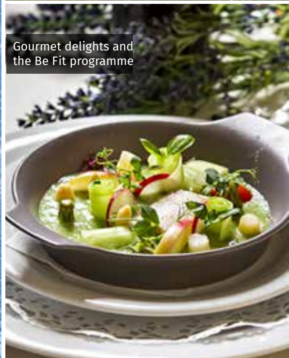
Gourmet delights and the Be Fit programme