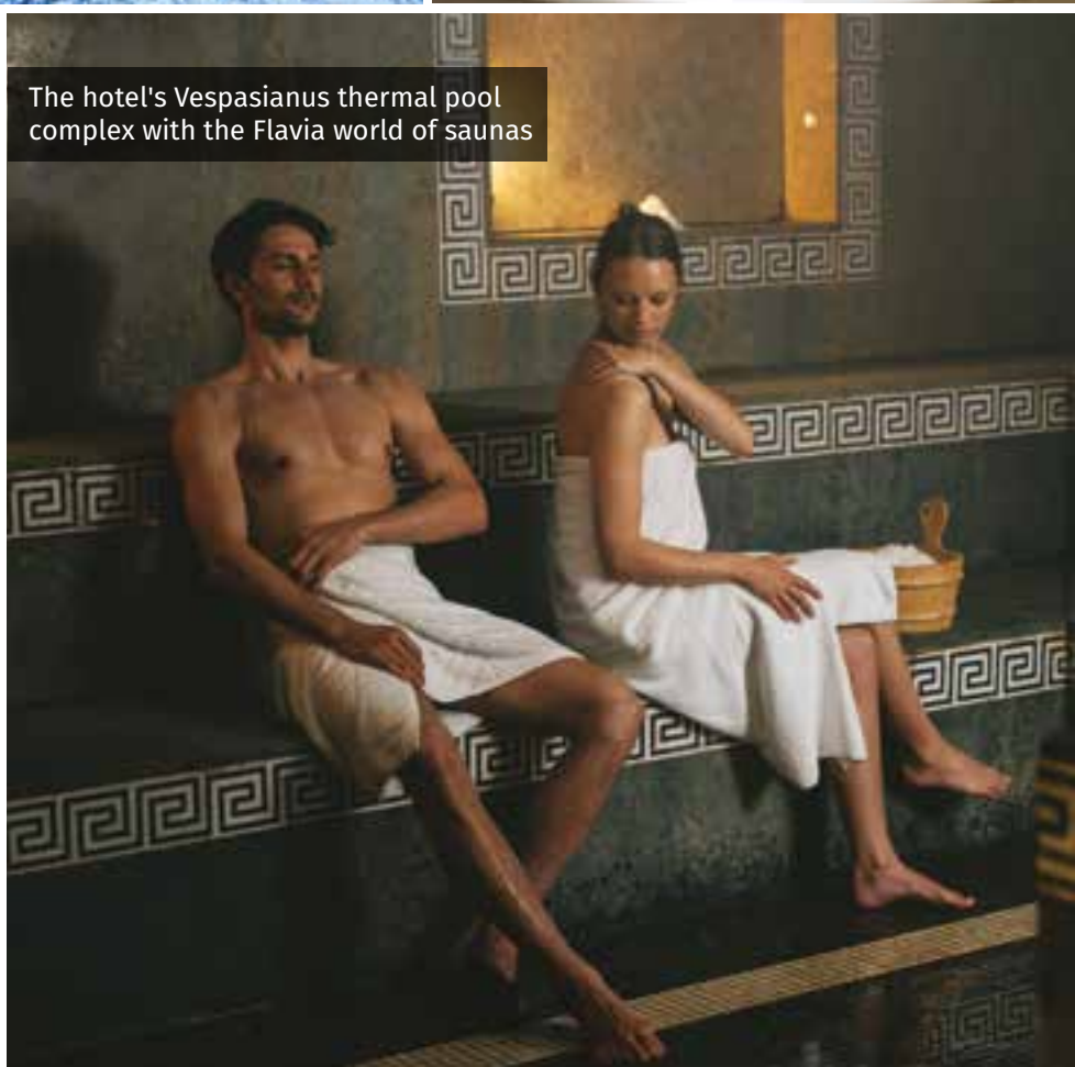
The hotel's Vespasianus thermal pool complex with the Flavia world of saunas