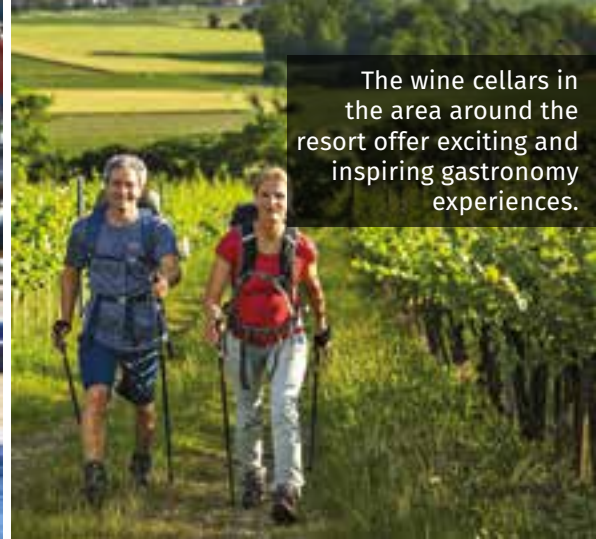
The wine cellars in the area around the resort offer exciting and inspiring gastronomy experiences.