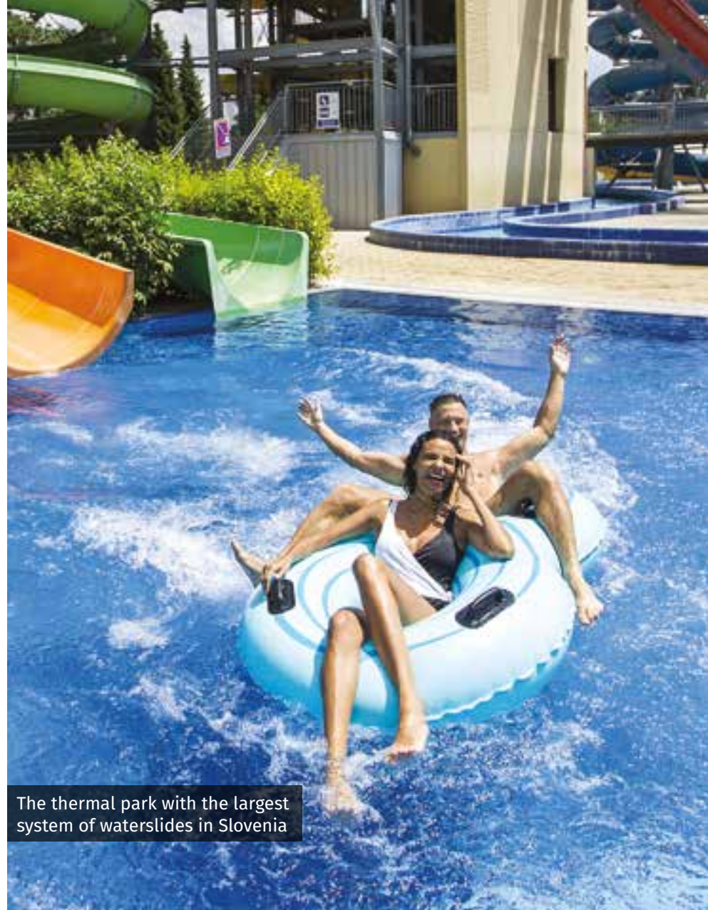
The thermal park with the largest system of waterslides in Slovenia