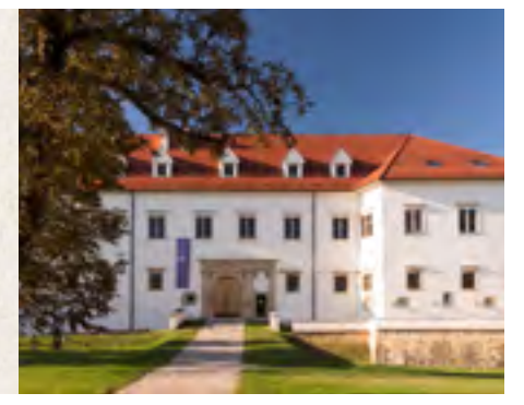
Negova Castle (14 km Negova Castle was converted into a castle from a wooden hunting mansion in the 11th century and expanded in the 15th century. Next to the castle, there is an abundant herb garden. www.kultprotur.si/sl/grad-negova

Nuskova Mineral Spring 24 km Around 30 years ago, while drilling several boreholes in the area of the village of Nuskova, a deposit of natural mineral water was discovered. There is a stop for hikers and cyclists at the spring.