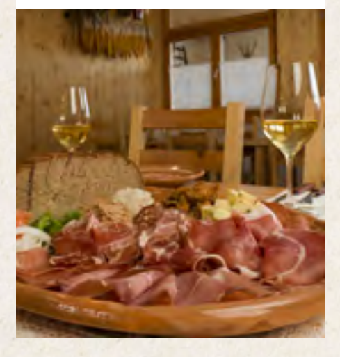
The Kodila Ham House 16 km The ham house offers tours and tastings of Pomurje hams and other delicacies. They will be happy to show you the thatched roof spaces where the Prekmurje hams are matured. www.kodila.si

Belak Winery – 4 km The Belak family has been growing grape vines for many years. Their renovated 400-year-old house, which they have mostly preserved in its original condition, is located on Radenski vrh and has a beautiful view. www.miam.si