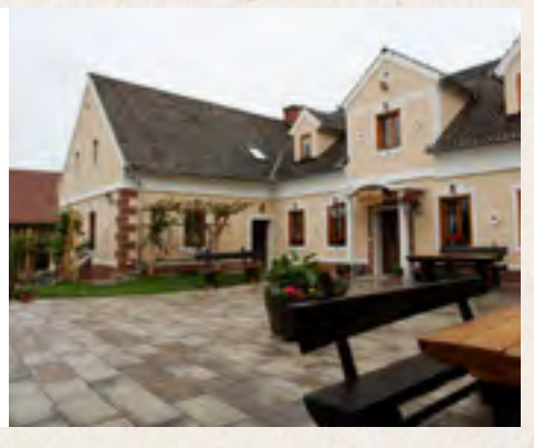
Firbas Agritourism Farm 711 km The Firbas Agritourism Farm treats you to authentic local food. If you want to spend more time here, you can try your hand at some farm chores. www.firbas.com