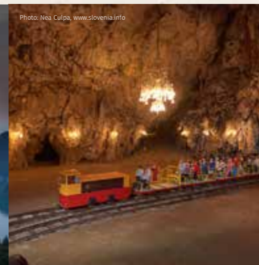
Postojna - Postojna Cave