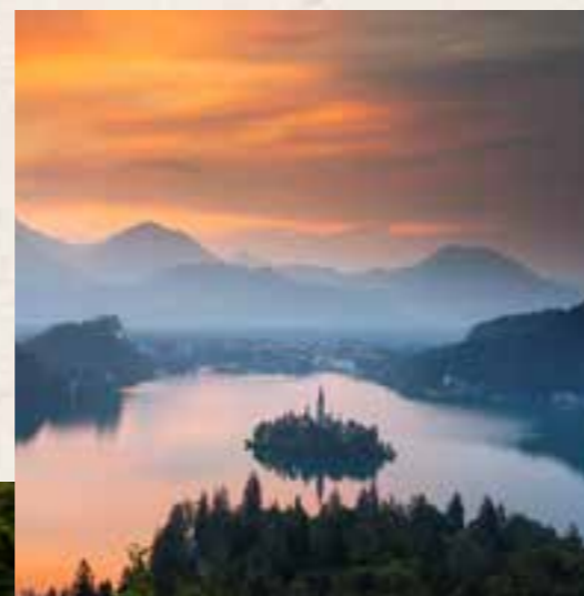
Bled - Lake Bled