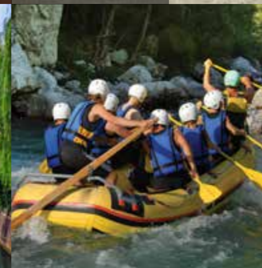
Soca valley - Soca river