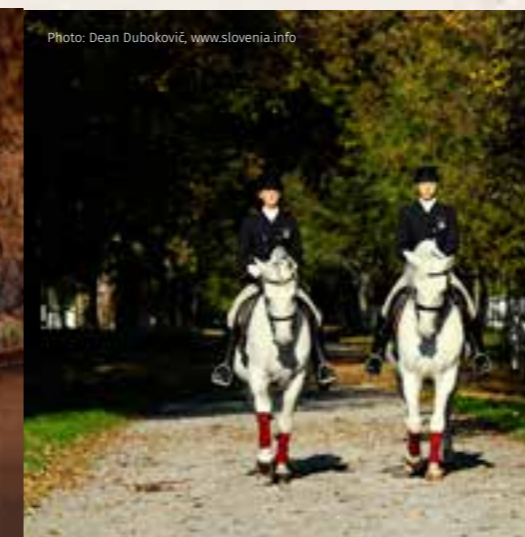
Lipica - Stud farm Lipica