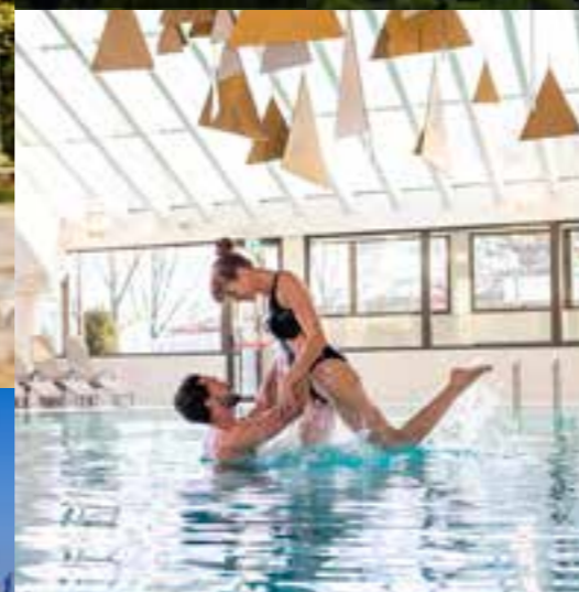
Beneficial thermal water