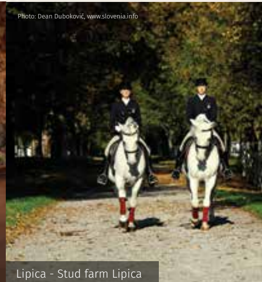
Lipica - Stud farm Lipica