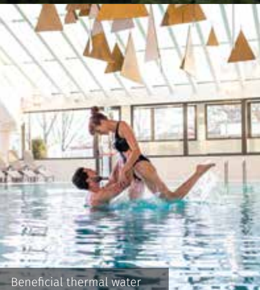
Beneficial thermal water