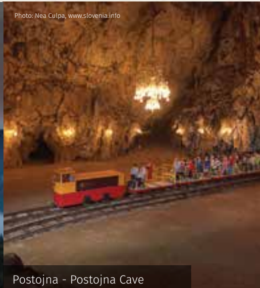
Postojna - Postojna Cave