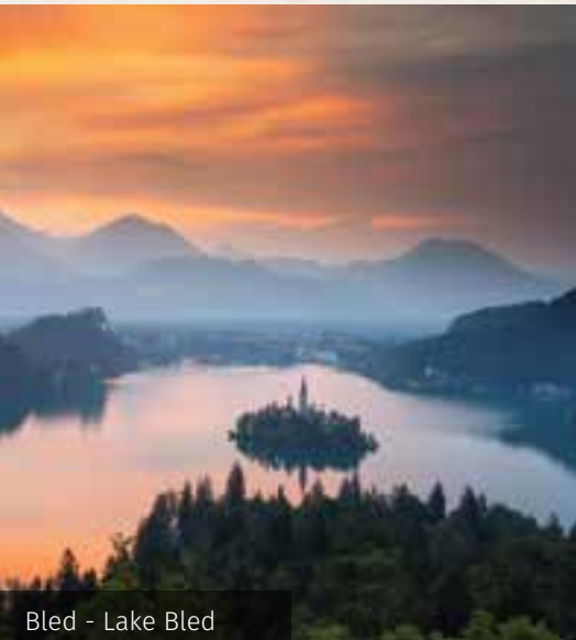
Bled - Lake Bled

Venice, Marco Polo 190 km (I) Klagenfurt 196 km (A)