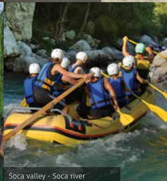
Soca valley - Soca river