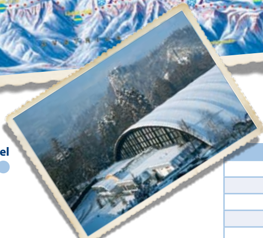
Bled Sport hall