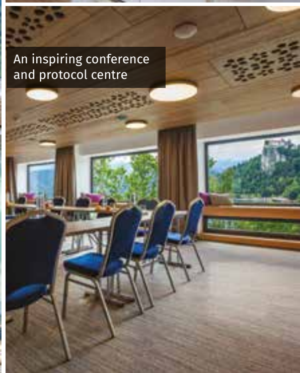
An inspiring conference and protocol centre