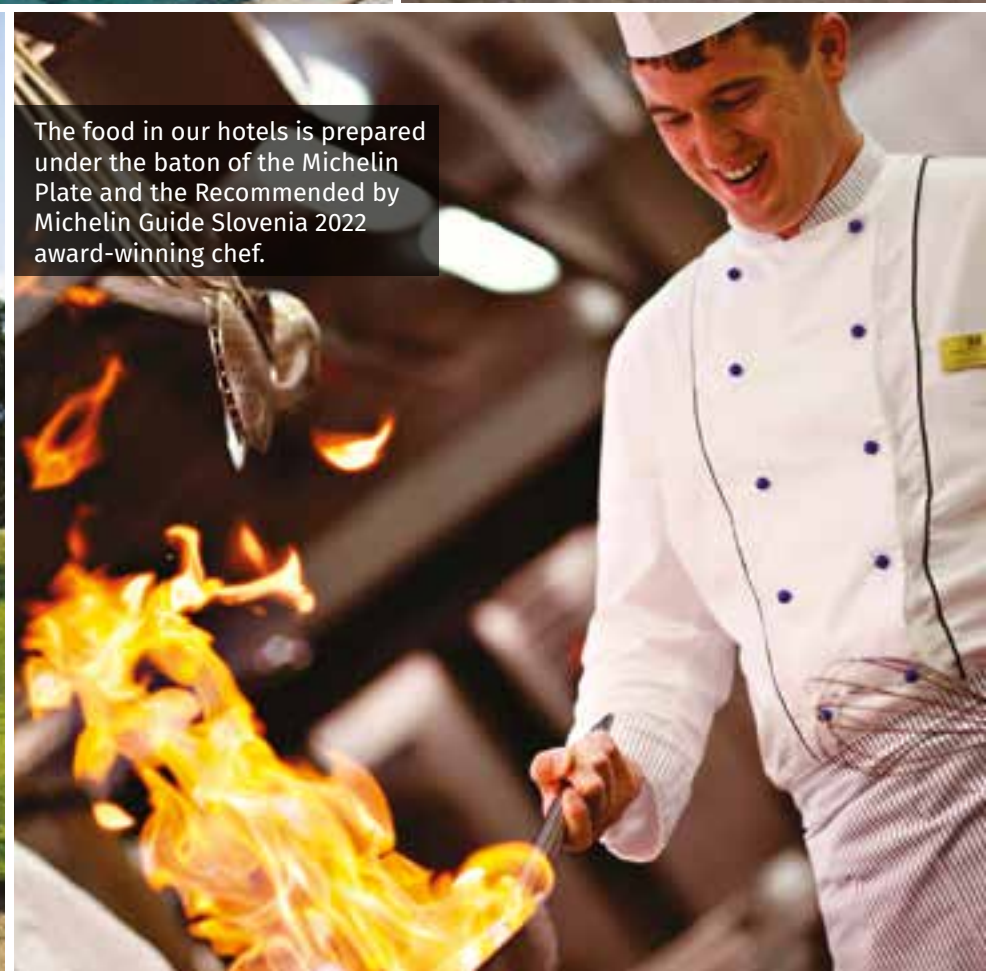
The food in our hotels is prepared under the baton of the Michelin Plate and the Recommended by Michelin Guide Slovenia 2022 award-winning chef.