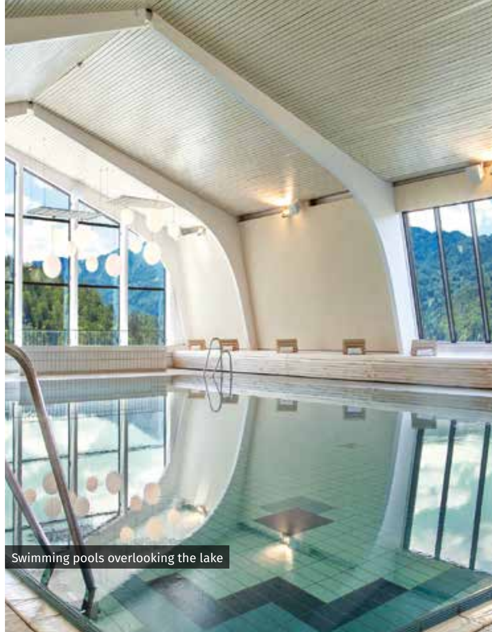
Swimming pools overlooking the lake