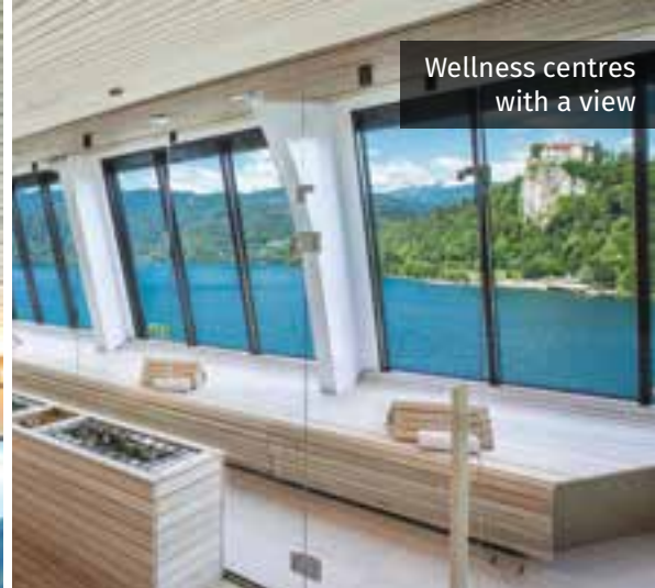
Wellness centres with a view