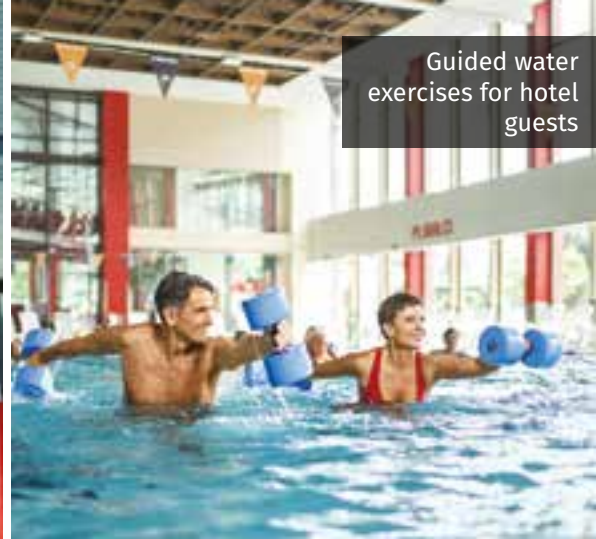
Guided water exercises for hotel guests