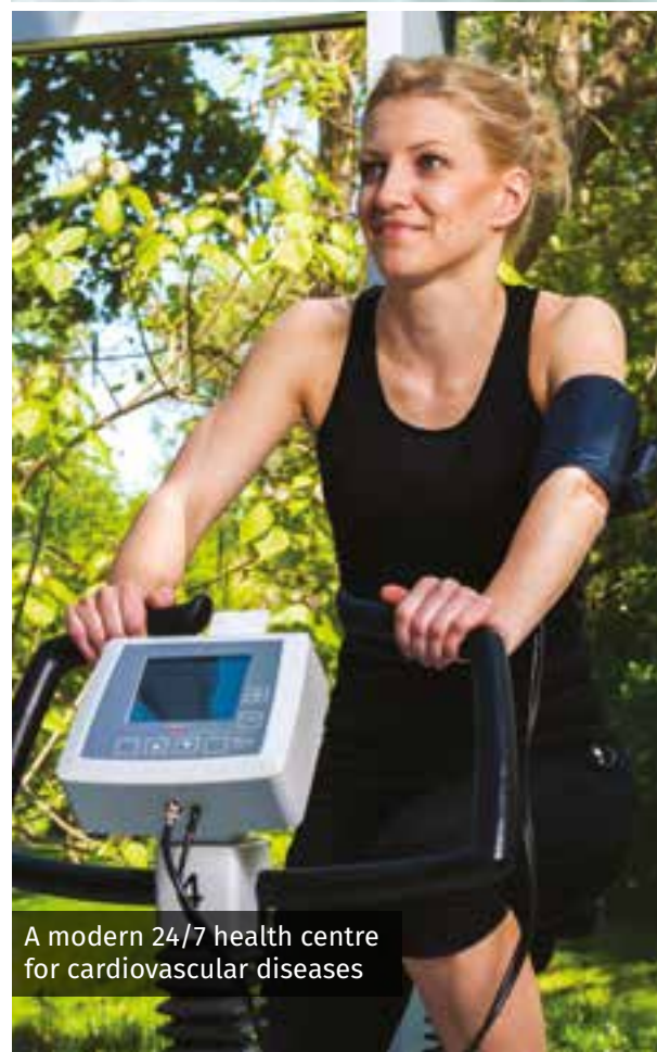
A modern 24/7 health centre for cardiovascular diseases