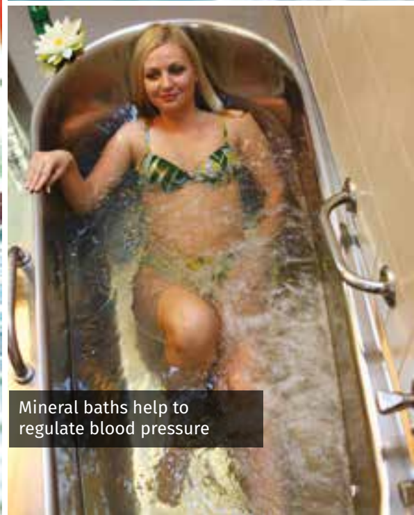
Mineral baths help to regulate blood pressure